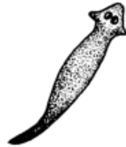
Planaria or Flatworm